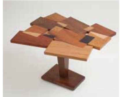
A Game of Hide and Seek

the skills of prisoners and exprisoners she has personally trained and worked with for the past thirteen years. The initiative is one example of successful social entrepreneurship for regional brands. (sarahsbag.com)